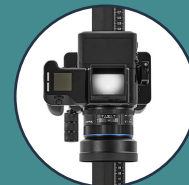
Phase One XF