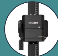
Phase One iXG

While our camera and software offer simplicity, quality, and throughput, the Versa accepts any camera. You can purchase a Versa on one budget cycle and our camera on the next, or upgrade the camera anytime.